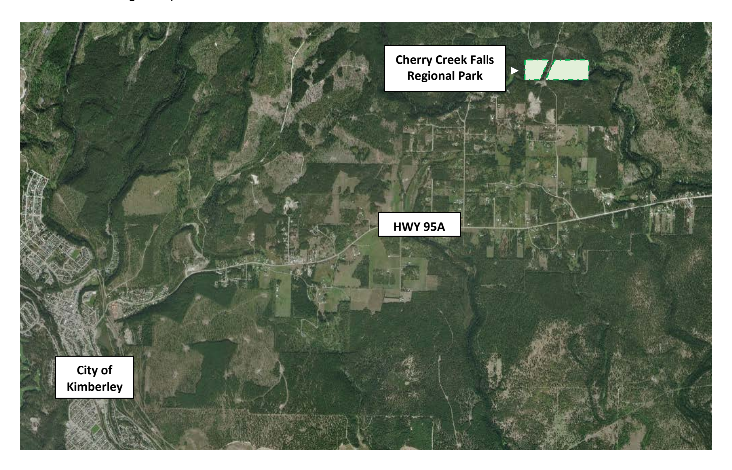
FIGURE 1: LOCATION PLAN

The park is located approximately 9 kilometers east of the City of Kimberley. The park is accessed via Clarricoates Road and is located on the Ta Ta Creek Lost Dog Forest Service Road. The park is approximately 14 hectares (35 acres) in size. The park is divided by a 75 m wide strip of Crown land that follows Ta Ta Creek Lost Dog Forest Service Road. A parking area and amenities are located to the east of the road. Cherry Creek, also known as Mather Creek, runs through the park from west to east.