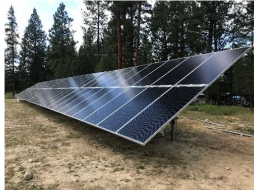
Wycliffe Exhibition Grounds Solar Panel Array