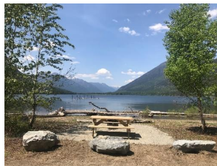
St. Mary Lake Regional Park Picnic Site

St. Mary Lake Regional Park developments were completed in spring. This included eight picnic sites with tables and fire rings, barrier rocks around the parking area, and installing new signage and a kiosk.