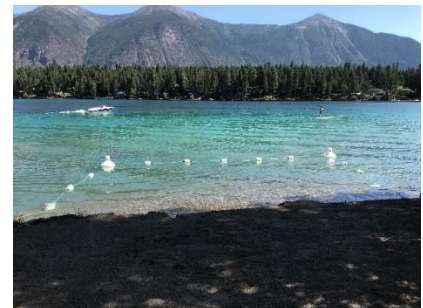
Rosen Lake West Access Swim Lines and Buoys