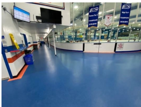
2019 Matting Installation

There were many upgrades completed at the Eddie Mountain Memorial Arena in 2019, including new protective rubber matting in the front entrance lobby as well as in the men's and women's washrooms. 10 new toilets were installed in the dressing rooms, first aid room and mezzanine, along with 5 new waterless urinals. We completed painting the remaining half of the exterior along with installing new security cameras to the exterior of the facility.