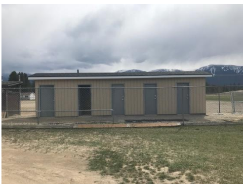
2019 Crossroads Washroom completion

The new washroom facility has five individual washrooms outfitted with sinks, toilets and a waterless urinal in each stall. The backstop on Diamond #2 was replaced along with the repairing of damaged fencing around each diamond. Towards the end of the season, we removed the old gravel on Diamond #3 and added new shale to the entire diamond.