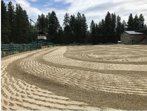
Wycliffe Exhibition Grounds Arena Footing

The Wycliffe Exhibition Grounds received the Banner at the Canadian Professional Rodeo Association in Red Deer for the 2019 Best Footing Award in the “Most Improved Ground” category.