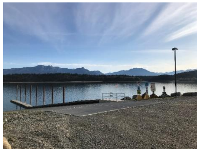
Koocanusa Boat Launch