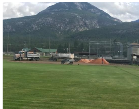
2019 Shale Installation