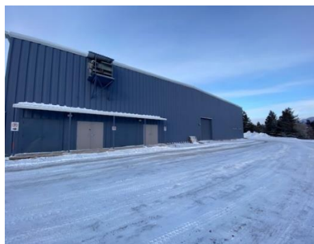
Exterior Painting Completion