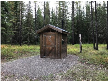
Elk Valley Park Outhouse