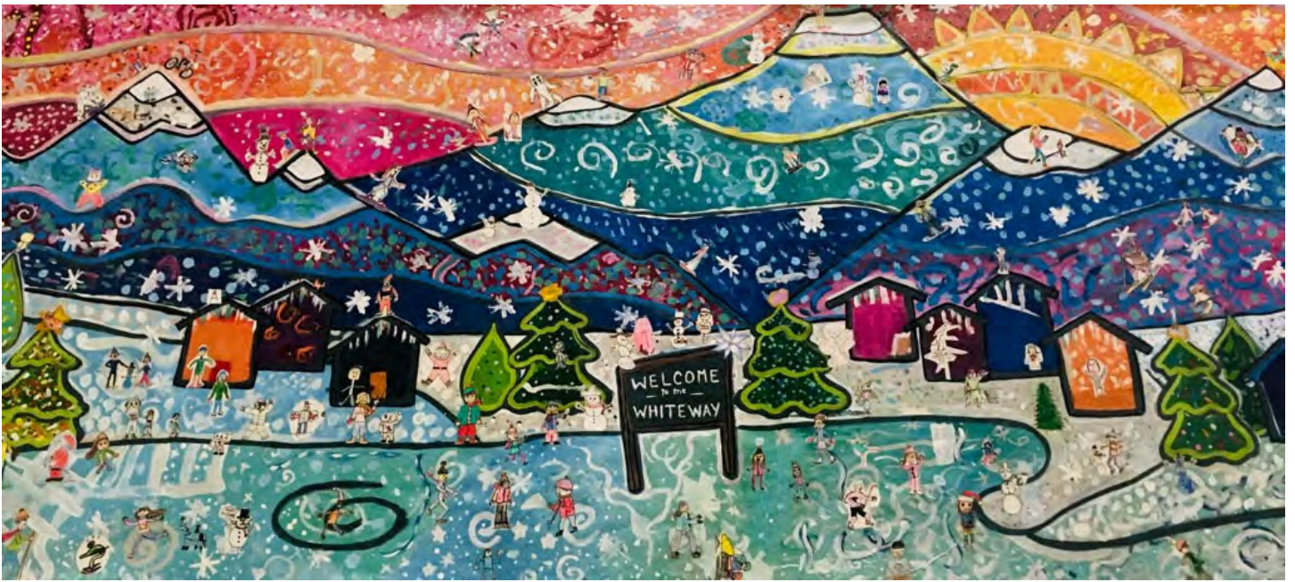
Whiteway Artwork by the students of JA Laird Elementary