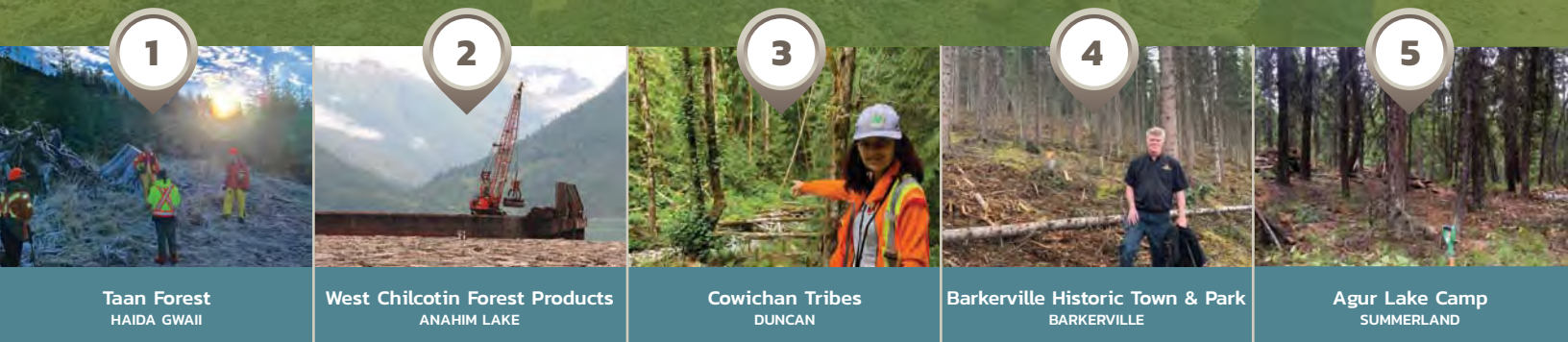
Taan Forest HAIDA GWAII